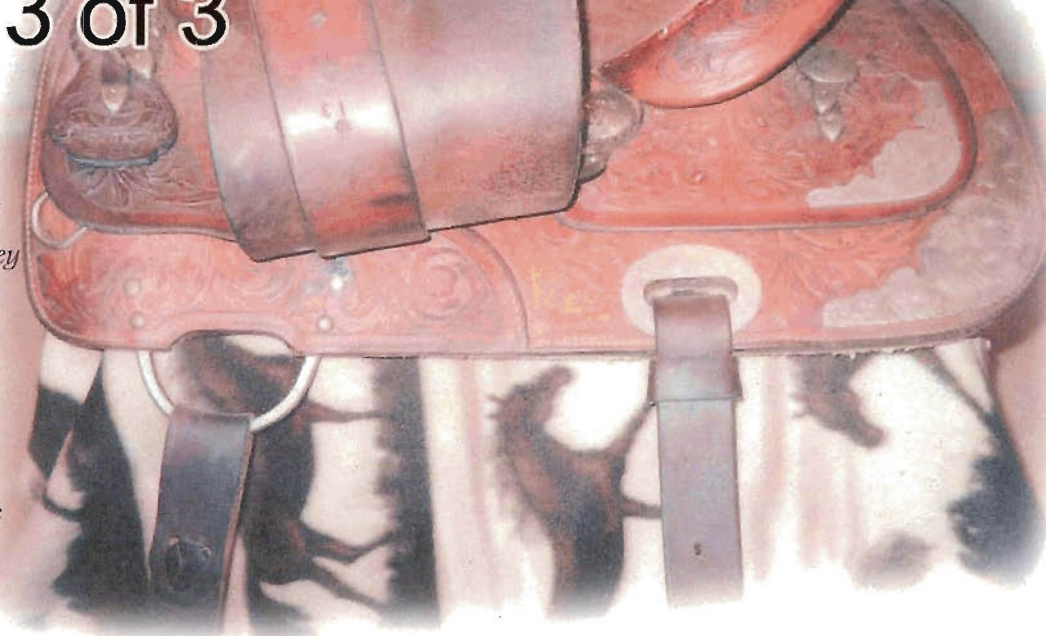
A saddle with "In-Skirt" rigging, reinforced with rivets on the front cinch, and and decorative metal on the backcinch. Full rigging.

So far in the previous two articles we have covered a lot of material on how saddles are structured, how they can work properly or improperly, and varying factors that can influence their performance. In this last article we look at ways to make a current saddle that is not fitting or functioning properly become